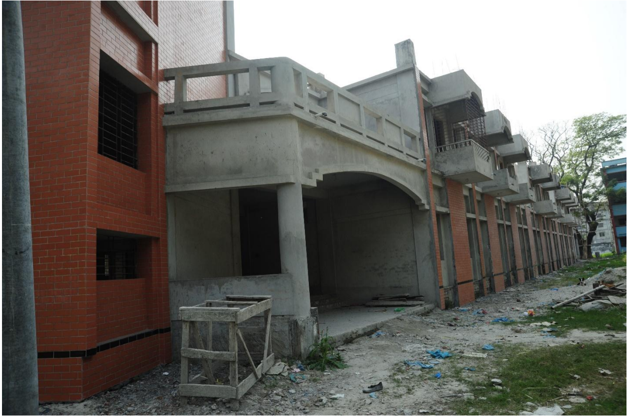
New Hostel Building